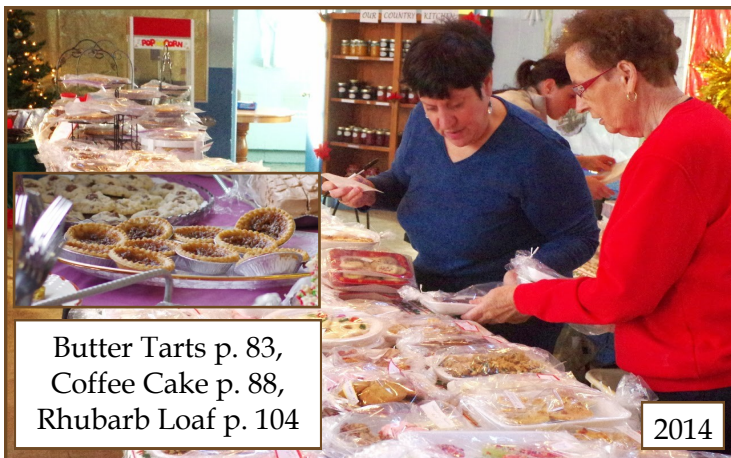
Butter Tarts p. 83, Coffee Cake p. 88, Rhubarb Loaf p. 104