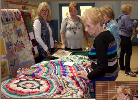
Family Night and Potluck, Talent Show and Arts & Crafts January 21, 2017