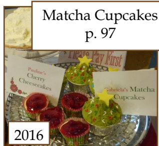
Matcha Cupcakes p. 97