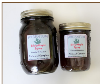
Maple Syrup p.119