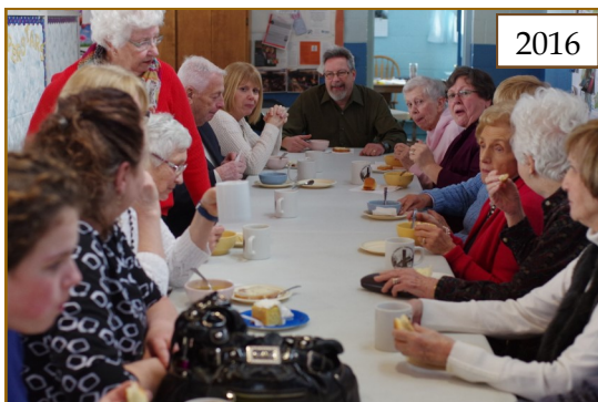
Fellowship Hour p. 36