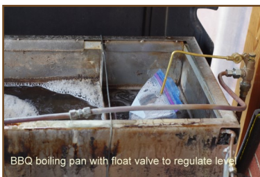
Silver Maple Syrup