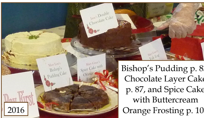
Bishop's Pudding p. 83, Chocolate Layer Cake p. 87, and Spice Cake with Buttercream Orange Frosting p. 107