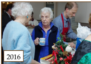
Mulled Hot Apple Cider p.116