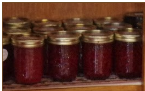
Rhubarb Pineapple Jam p.122