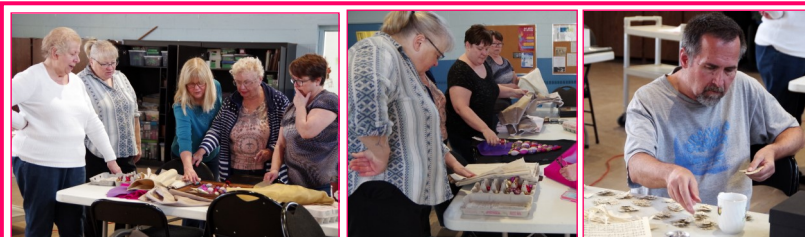
Our Craft Guild brainstorming and hard at work